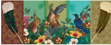
Bairds Mainfreight Primary School